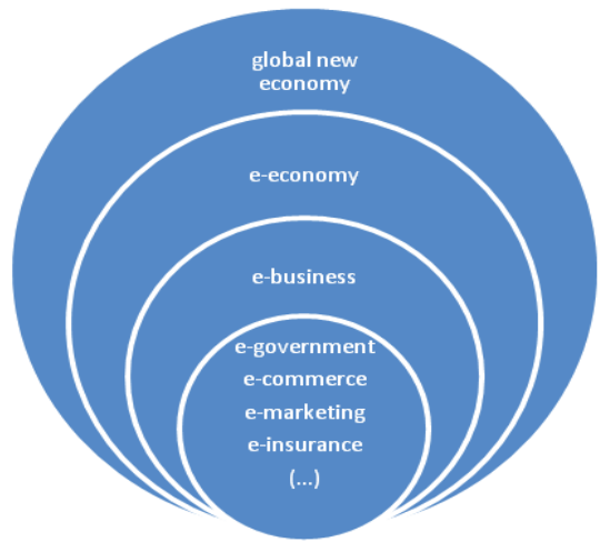
Figure 1. The divisions within the new economy

not only a choice, but a necessity. There is a new quality in the economy, based on increasing development of new technologies. According to experts, they need to be standardized and harmonized across the world (Papińska-Kacperek, 2008, pp. 409-410). To remain competitive in the world market, all countries need to take care of the development of the information society structures. Countries within the EU have to accept a number of provisions related to the development of the information society. A very important element here is e-government (Doktorowicz, 2005, p. 159). Figure 1 presents the division within the new economy, and the position of e-government.